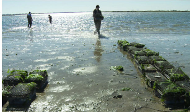
Restoration efforts along the Hudson River, where bountiful oyster beds once made New York City the "oyster capital of the world." Shellshocked

Nineteenth-century New York City was an oyster lover's paradise. One-cent food carts shucked tasty morsels on the spot; baskets of bivalves crowded the harbors for export across the U.S. and to Europe; and oyster middens, huge heaps of discarded shells, seemed to rival the tall towers of downtown Manhattan. Some 9 billion oysters once sucked and filtered 350 square miles of muddy water within the Hudson River Estuary, and dubbed NYC "the oyster capital of the world." Unfortunately, this utopian pact between sea and city did not last.